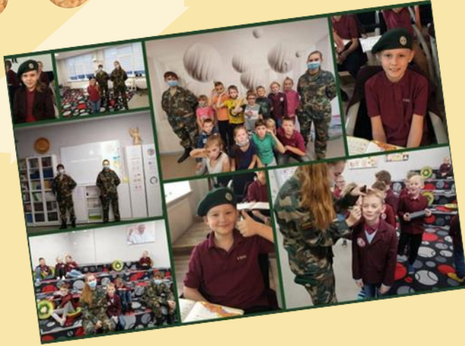
Collaboration between teachers working in different stages

Collaboration between teachers working in following stages such as: